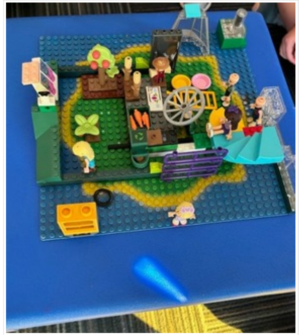
LUNCHTIMNE CLUB OUTDOOR GAMES