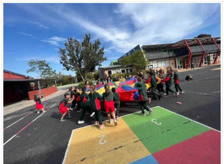
BUCKET FILLER - TERM 2 WEEK 4