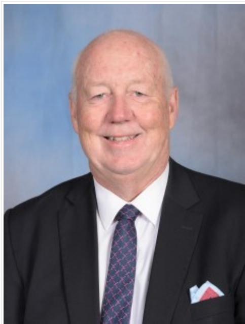
MOTHER'S DAY PRAYER

day is a challenging time I pray that beautiful memories brought you some joy.