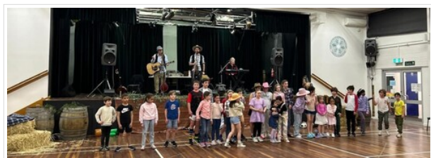
Father's Day & Special Friends' Breakfast - Week 7 - Wednesday, 28th August