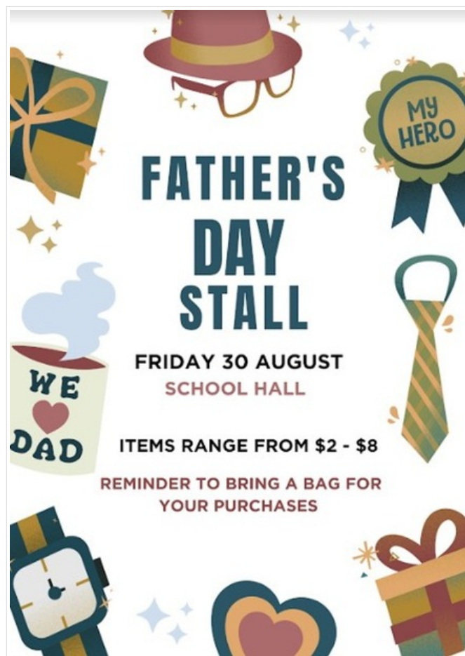
Father's Day Stall - Week 7 - Friday, 30th August

PHOTO SLIDESHOW: Please send a photo of your children with dad or a special father figure to community@spbentleigheast.catholic.edu.au to be included in the photo slideshow.