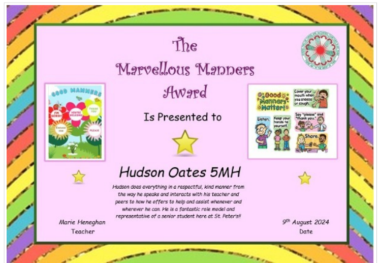
STAR AWARDS - TERM 3 WEEK 4 - TEAMWORK