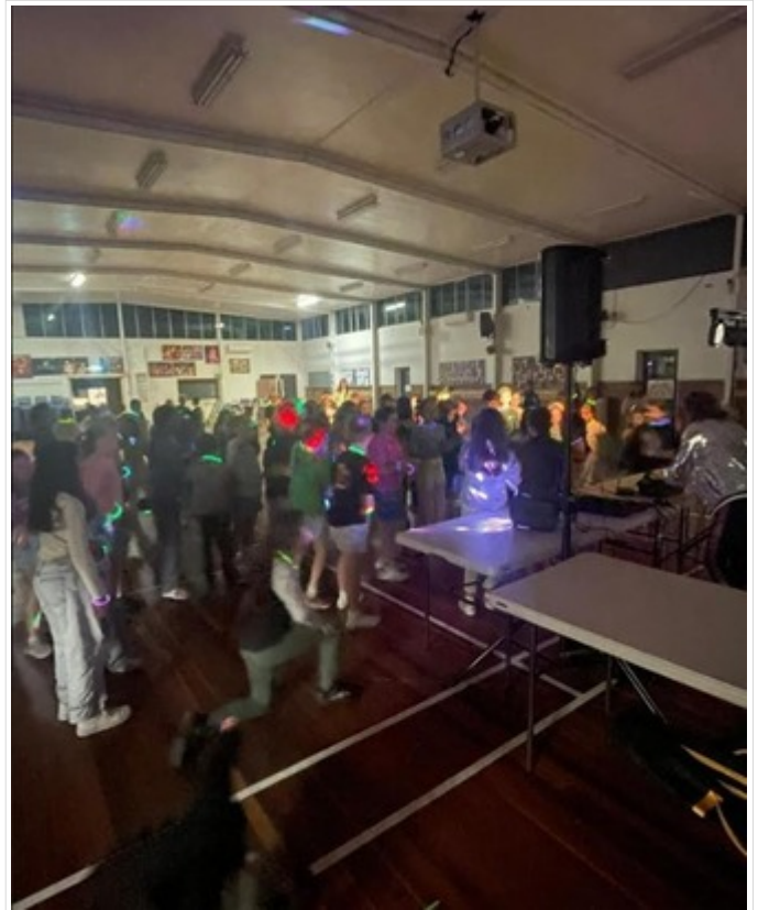
ST PETER'S TRIVIA NIGHT - Saturday, 15th June